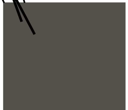
SW 7048 Urbane Bronze Interior / Exterior