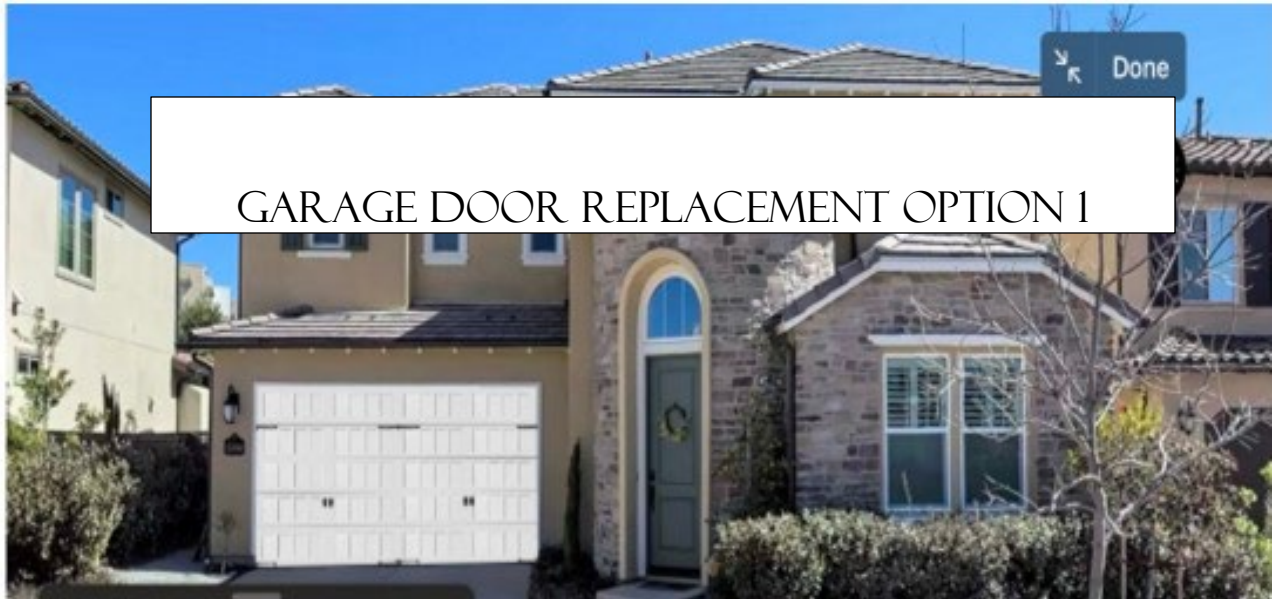
GARAGE DOOR REPLACEMENT OPTION 1