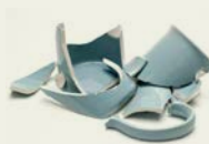
Broken Ceramic Dishes & Pots