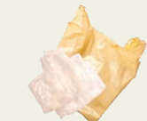
Plastic Bags & Film

Organics/Recyclables Hazardous Waste Electronics & CFL Bulbs Batteries, Tires or Paint Flammable Material