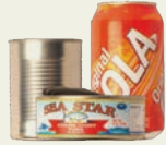
Food & Beverage Cans