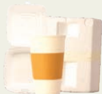
Foam Cups & Containers